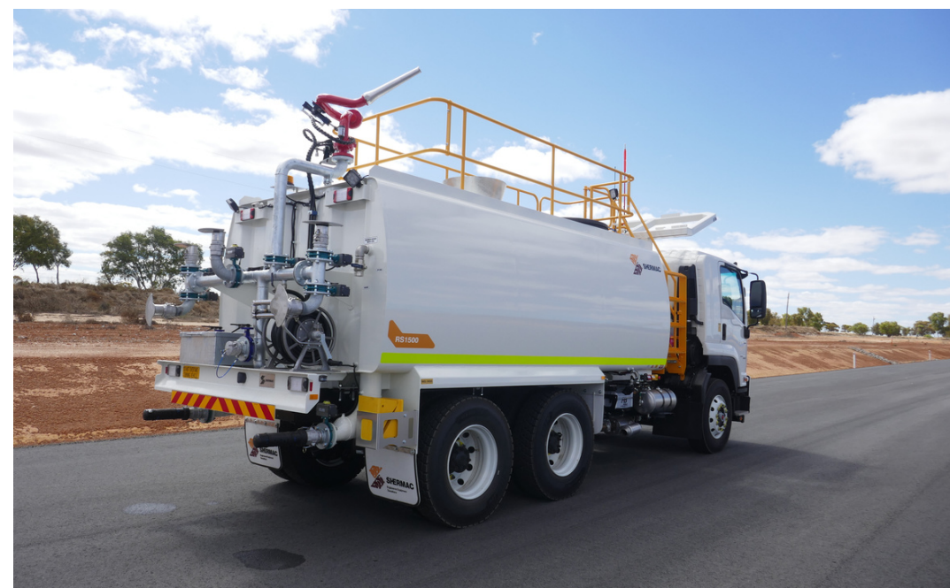
ON-ROAD WATER CART 14,000L water tank, to suit 6x4 chassis