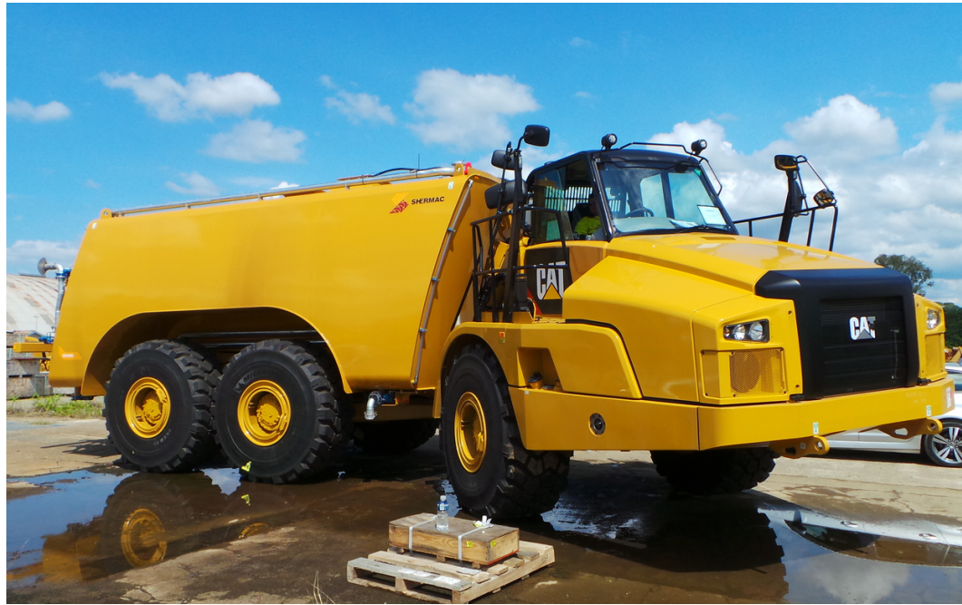
OFF-ROAD WATER CART RS4000 to suit Volvo A40 chassis