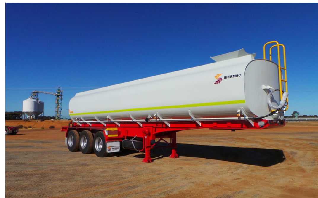
ON-ROAD WATER CART RS3000